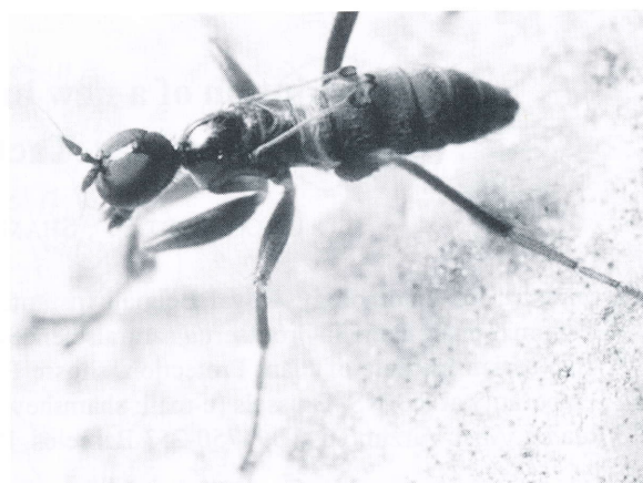
Fig. 1. Habitus male Ariasella lusitanica sp. nov. (photo by Jorge Almeida).

Abdomen brown, finely greyish pollinose;